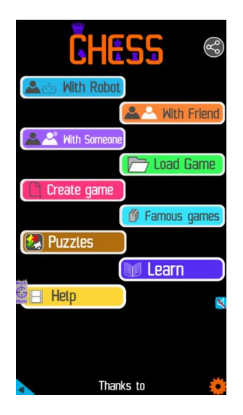
Figure 1.7: Play chess online for free. Solve puzzles and play with friends

Play chess for free at https://gbud.in/chs